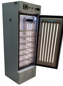
Detail: lights on door and sides