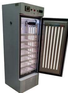
Detail: lights on door an sides